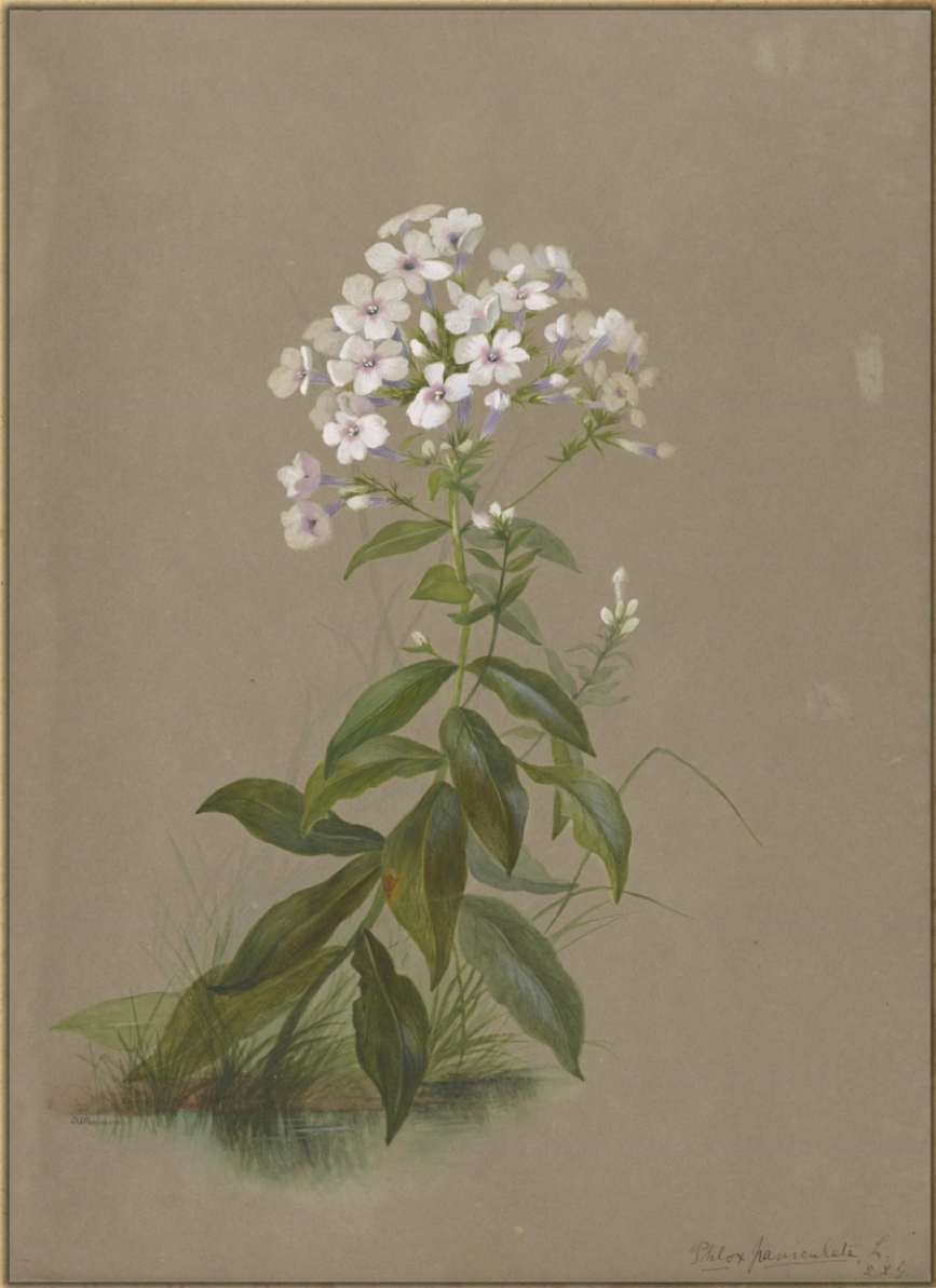
Phlox paniculata L. 2 x 6

KD 8099 1 26 2 25 3 23 4 22 5 21 6 20 7 19 8 18 9 17 10 16 11 15 12 14 13 Stamp: OCT 1958 Stamp: LIBRARY OF THE UNIVERSITY OF MICHIGAN Stamp: ANN ARBOR, MICHIGAN